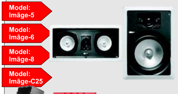
Image 2-Way In-Wall Speakers